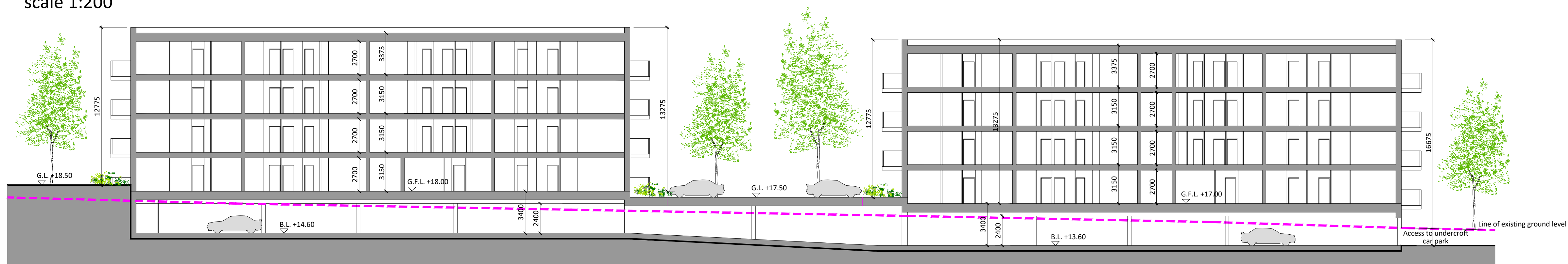
Section A-A Ground Floor Level (Block A & Block B)